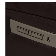
POWER BUTTON WITH USB CHARGER