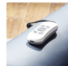
HAND HELD WAND

Visit Palliser.com to view all current product spec sheets