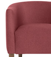
DOUBLE NEEDLE TOP STITCHING