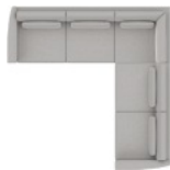
B2/9B/B3 116 x 116" 295 x 295 cm