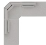
20/9W/19 117 x 117" 298 x 298 cm