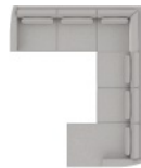
B4/90/15 112 x 135" 285 x 343 cm