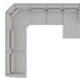
A2/9W/90/15 147 x 140" 374 x 356 cm