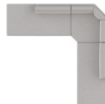
20/9W/19 112 x 112" 285 x 285 cm