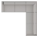
B2/9B/B3 111 x 111" 282 x 282 cm