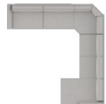
A2/9W/90/15 135 x 142" 343 x 361 cm