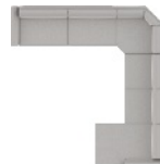
A2/9W/90/15 135 x 142" 343 x 361 cm